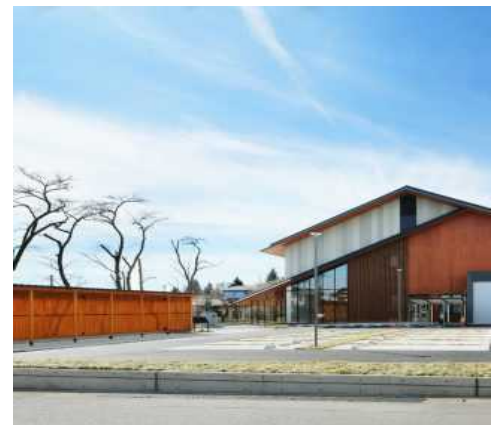
日光市市民活動センター NIKKO Civic Activities Support Center