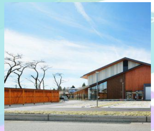
日光市市民活動センター NIKKO Civic Activities Support Center